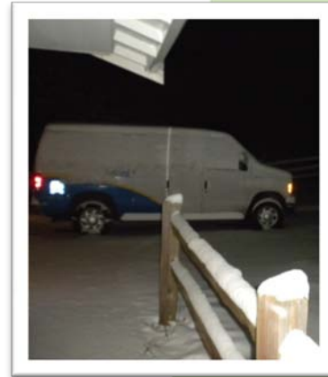
Vanpool at rest

Hang in there—less than three months until spring!