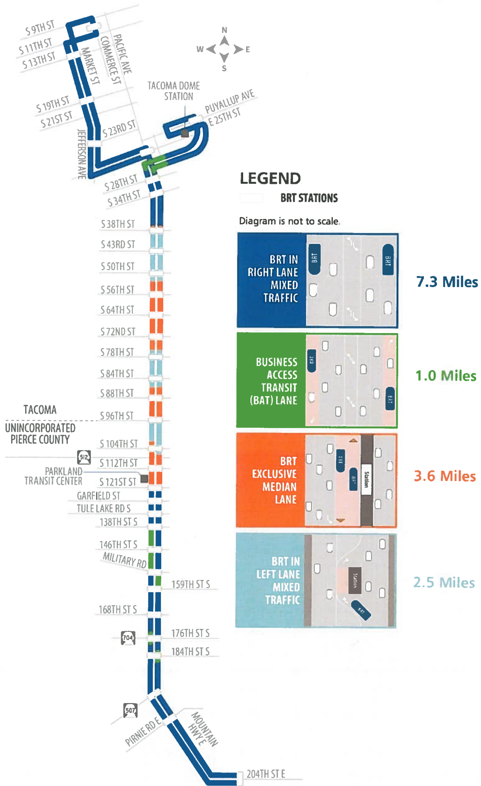
Exhibit B: Proposed Pacific Ave/SR 7 BRT Project Map